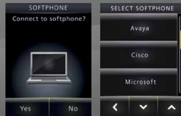
SETTING UP THE HEADSET