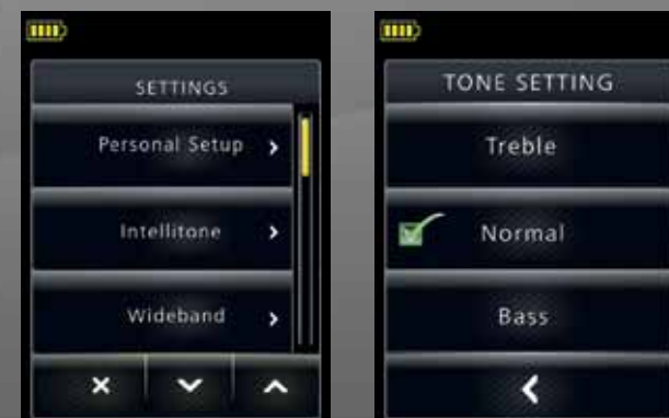
PERSONALIZING THE HEADSET