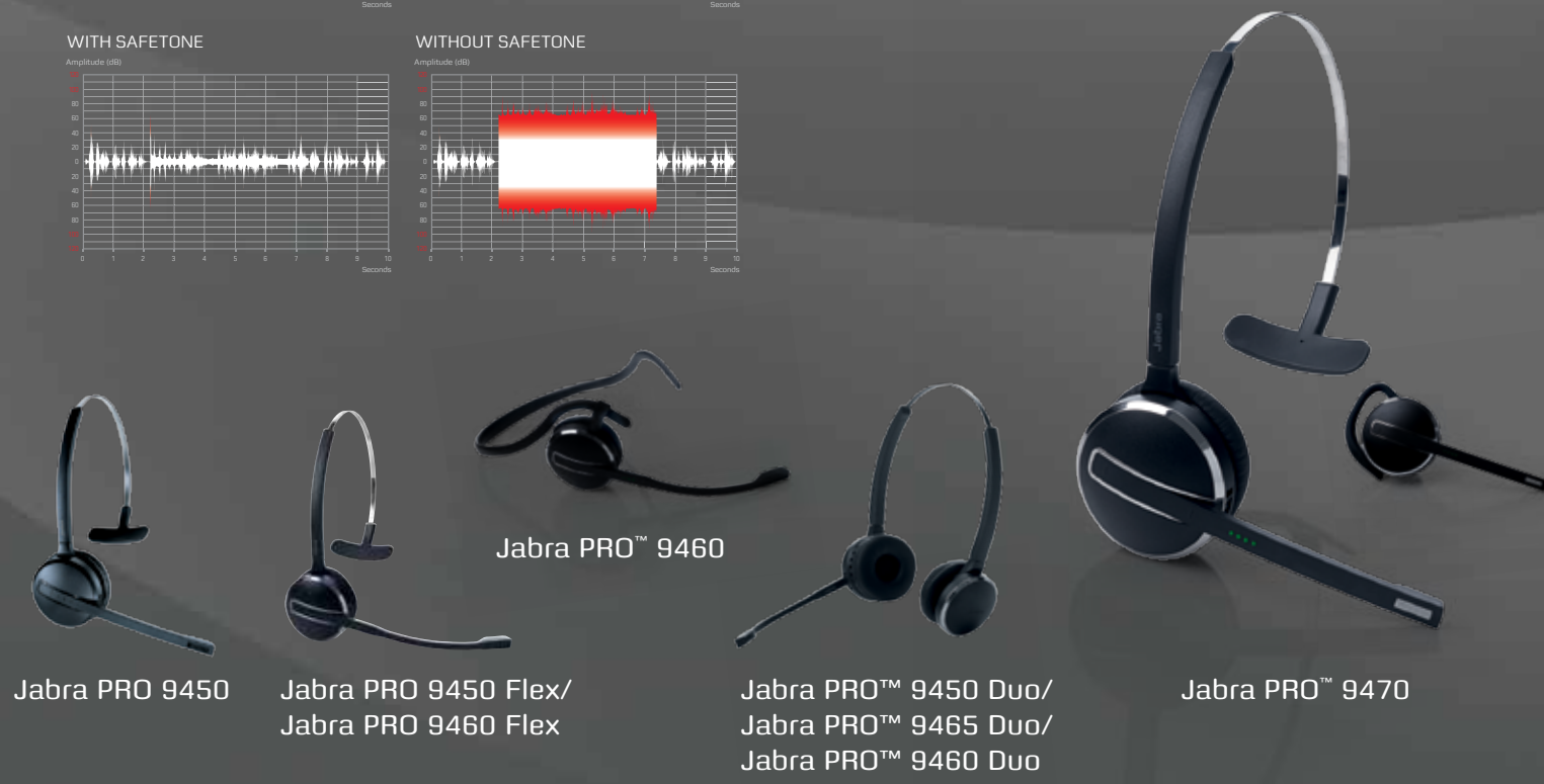
Jabra PRO 9450

Jabra PRO™ 9400 Series headsets' stylish, discreet design is adaptable for different wearing styles that ensure a perfect fit all day long. As Unified Communications becomes the norm, users will be wearing their headsets for longer periods, making comfort more important than ever. Choose between a headband, neckband or try the unique Jabra earhook. All wearing styles allow for easy adjustment for use on the left or right ear.