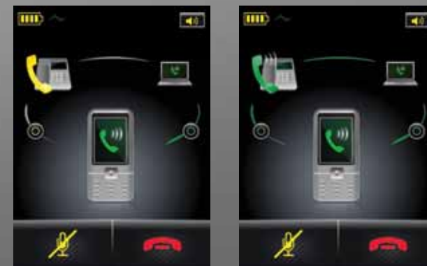
MERGING A CALL

It's easy to get started, too. A SmartSetup wizard on the touch screen guides you through the simple process of connecting phones and choosing preferences to get you started in minutes. Once you're up and running, the screen's colorful icons and intuitive menu system make call-handling a breeze.